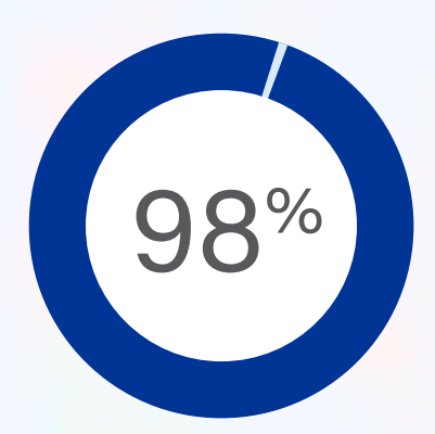
GRESB particpants are collecting building energy data.

One hundred and eighty one CEOs committed to leading their companies for the benefit of all stakeholders, not just shareholders, via the Business Roundtable's new Statement on the Purpose of a Corporation.